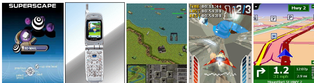
Figure 3: Swerve (Superscape), Mascot Capsule (Hi-Corporation), XenGames, X-Forge (Fathammer), TomTom.

A number of companies offer already 3D rendering engines for mobile devices mostly in the form of games and entertainment software. For example (Figure 3), Superscape-Swerve ( www.superscape.com ), HI Corporation ( www.hicorp.co.jp ), Xen Games ( www.xengames.com/ ) and Fathammer Inc. ( www.fathammer.com/ ). The navigation software TomTom (running on Windows CE) is another example of 3D visualisation, i.e. a '3D birds eye' view of a navigated route. Most of the 3D visualisation tools/games are available simultaneously for different OS. Still, the efforts are toward developing 3D games. 3D gaming on mobile phones is for some countries (e.g. Japan, using the rendering engine of Hi Corporation) already a standard item ranging from car racing to fishing and taking care of personal virtual pets. The Mascot Software engine is embedded into more than 10 million handset in Japan (Donelan 2003).